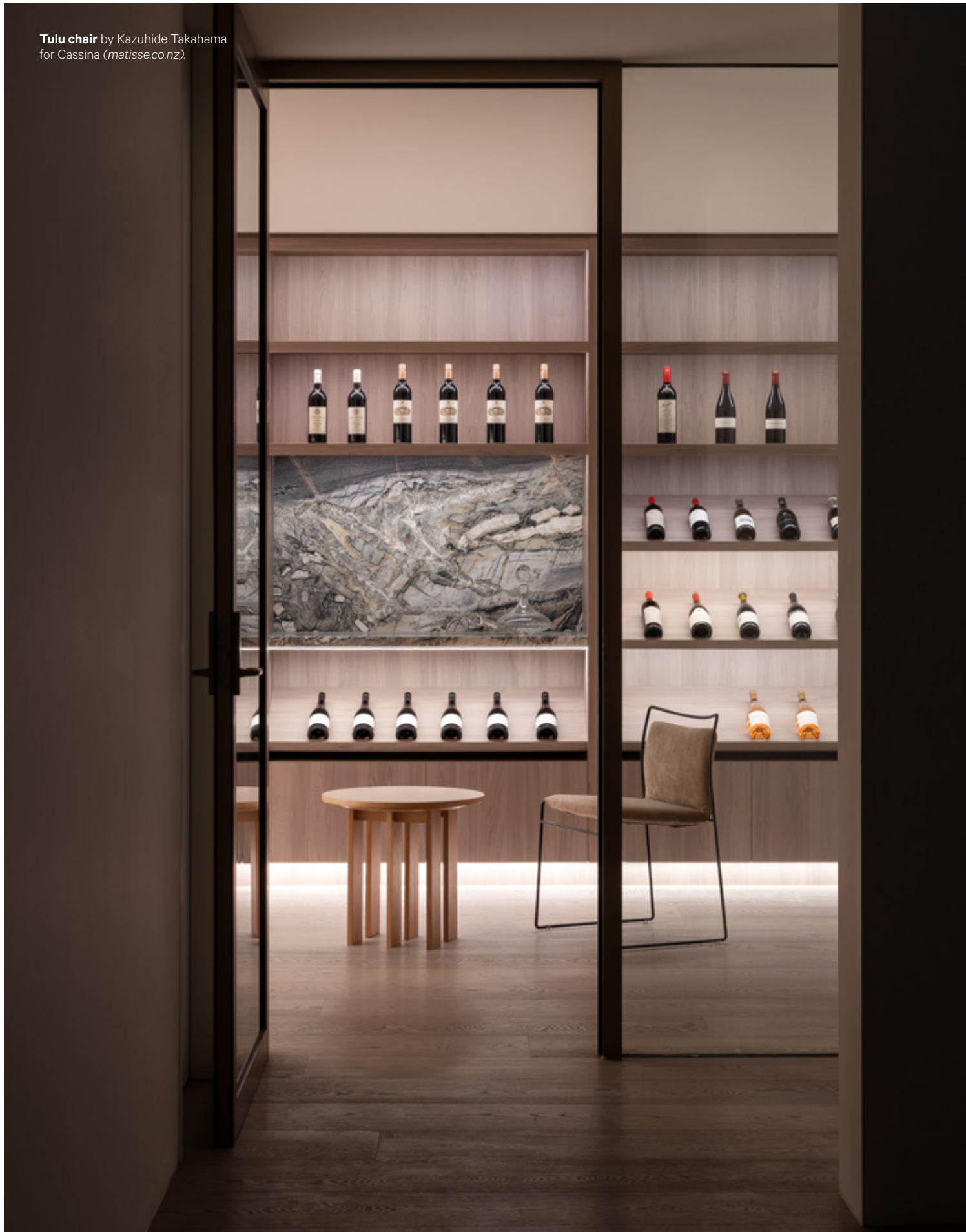
Tulu chair by Kazuhide Takahama for Cassina.